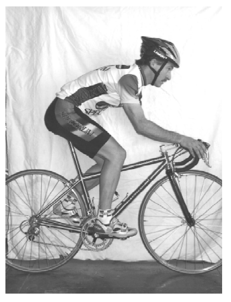
Crank arm facing camera at 3:00, hands on hoods.