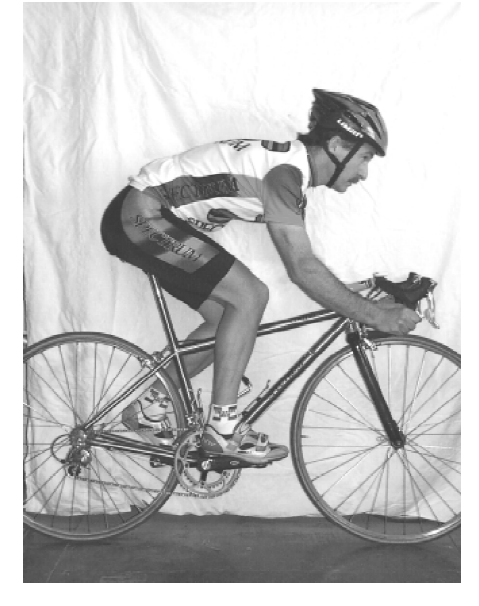
Crank arm facing camera at 2:45, hands in drops.

Supply photographs of yourself in the following positions on your current bicycle <u>taken at hip level in profile</u>. Please try to keep your posture, ankle position, arm bend, etc. as they are when you are riding. e.g. don't drop your heels or lock your arms. Be sure that you are positioned in the saddle where the <u>saddle</u> wants you, not where your arms or legs want you. Call with questions.