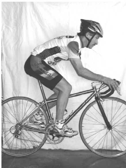
Crank arm facing camera at 3:00, hands on hoods.