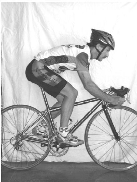
Crank arm facing camera at 2:45, hands in drops.

Supply photographs of yourself in the following positions on your current bicycle taken at hip level in profile . Please try to keep your posture, ankle position, arm bend, etc. as they are when you are riding. e.g. don't drop your heels or lock your arms. Be sure that you are positioned in the saddle where the saddle wants you, not where your arms or legs want you. Call with questions.